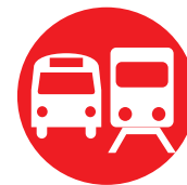
Transit & Freight Rail Professionals