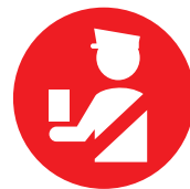
Customs and Immigration