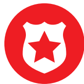
Law Enforcement Agencies