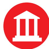
Government Policy Creators