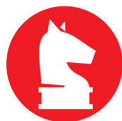
Senior Decision Makers

The 2022 IAWP Conference is expected to attract over 1,000 delegates from 70+ countries. As the largest gathering of female law enforcement globally, sponsorship of this event offers opportunities to connect directly with a cross-section of professionals including, but not limited to: